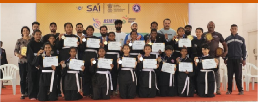
Sri Vijaya Puram, Feb.8