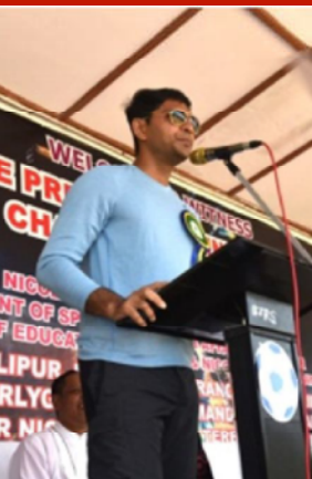
Car Nicobar, Feb.8

The eligible candidates have been advised to submit hard copy of a brief personal data along with related documents to the Office of the Principal, M.G. Govt. College Mayabunder - 744204, Andaman & Nicobar Islands on or before 19.02.2025. Application received after the due date will not be entertained. Proforma Bio-data may be downloaded from College website: http://mggcm.and.nic.in , a press release from MGGC said.