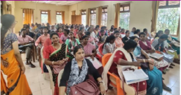
Sri Vijaya Puram, Feb. 8

Residents have been urged to submit their responses and contribute to making Sri Vijaya Puram a model city for cleanliness and sustainability. Feedbacks of the general public is crucial in shaping better policies and services. Let's work together for a Swachh and Sundar Sri Vijaya Puram, a press release from SVPMC said.